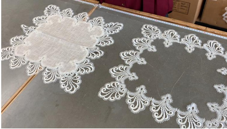
Slika 12: Table placements