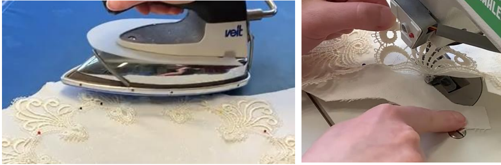
Slika 6: Sew the embroidery in place and trim the background