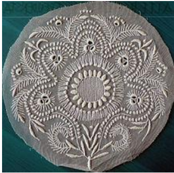
Slika 2: St. Gallen embroidery design: medium-fine round motif

Swiss textile merchants from St. Gallen learnt hand embroidery from Turkish women in Lyon around 1751. Through embroidery teachers, this craft was spread in north-east Switzerland and from 1763 also in Vorarlberg. In 1828, Josua Heilmann from Mulhouse developed a hand embroidery machine that passes a double-pointed needle all the way through a fabric and back again at another point. This gave rise to St. Gallen embroidery as a globally successful export product, with Saurer as the most important embroidery machine manufacturer of the late 19th century. The chain stitch machine and the Schiffli embroidery machine were invented in 1863. From 1880, these machines were further developed in Saxony by the Vogtland machine factory in Plauen and