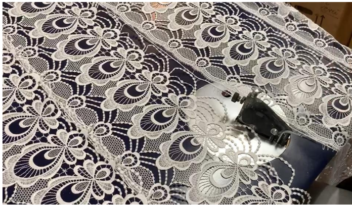
Slika 9: Different materials