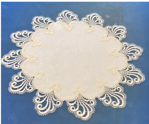
Slika 8: Finished table placement