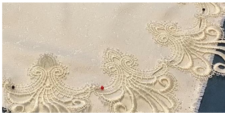
Slika 5: After the embroidery has been pinned to the fabric, the paper is removed and embroidery is ironed so that everything is smooth before sewing process