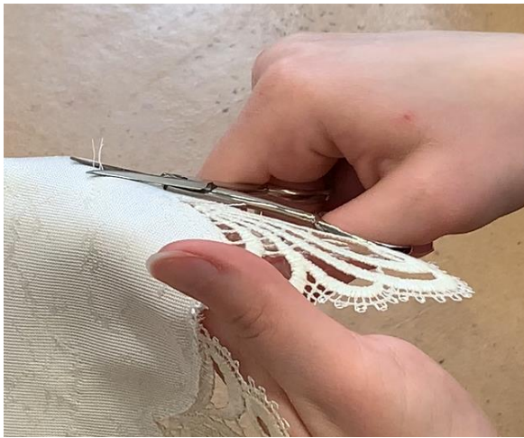
Slika 7: Cutting the sewing threads