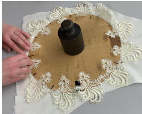
Slika 4: Pinning the embroidery with needles