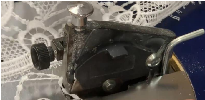
Slika 10: Knife to cut embroidery borders