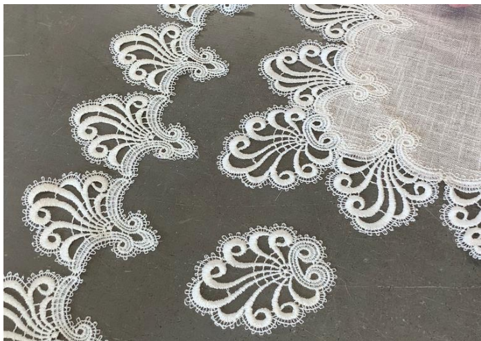
Slika 11: Decorative examples